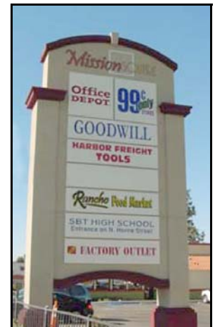
Monument Signage Available on Mission Ave